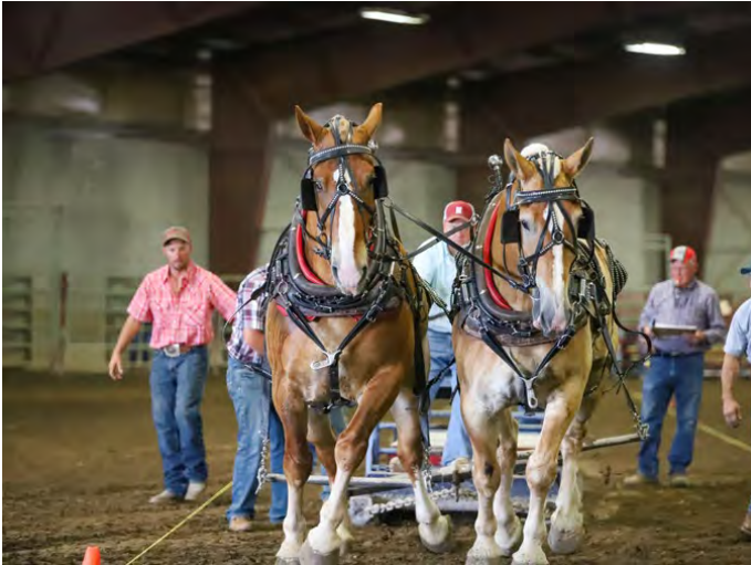
HORSE PULLS 6 p.m. | Riding Arena