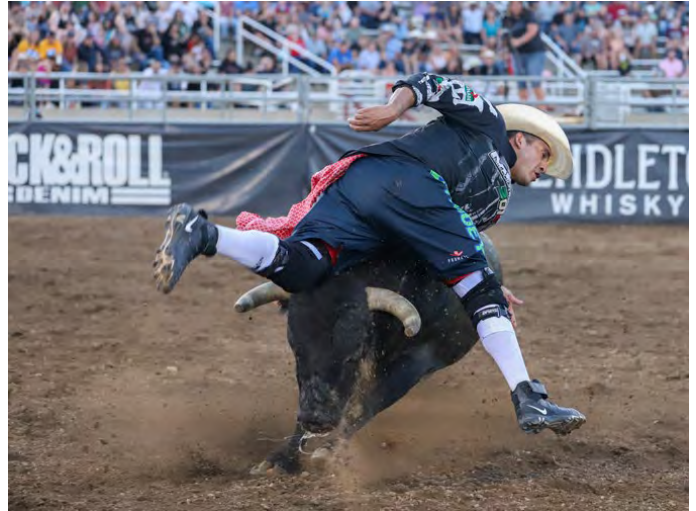
BULLFIGHTS 7 p.m. | Outdoor Stadium