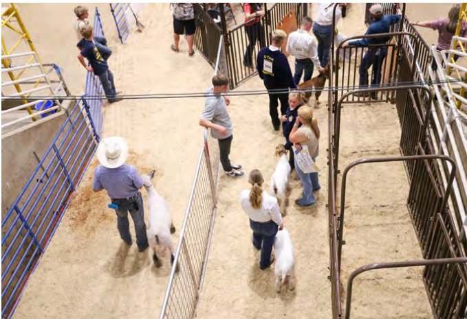
JR. LIVESTOCK AUCTION 9 a.m. | Golden Spike Arena