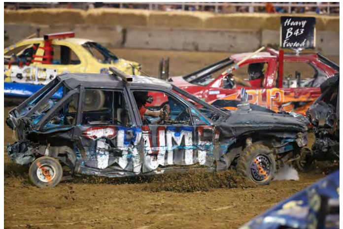
DEMOLITION DERBY 7 p.m. | Outdoor Stadium